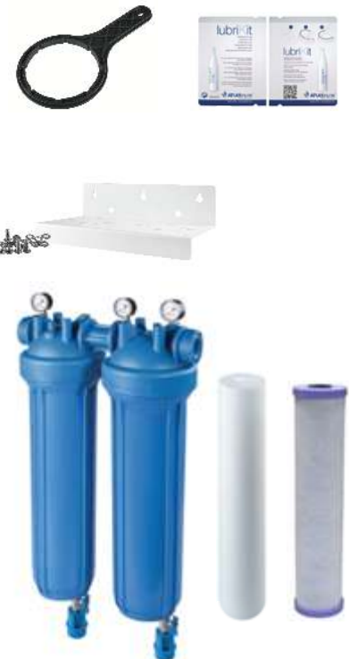
DP Big Plastic Housing Metal Powder Coated White Bracket Filter Wrench Lubricant

Atlas Filtri is driven to providing our customer with the best available products to meet specific filtration requirements. This is done by using the most advanced manufacturing and design methods. The international patents received come from a constant commitment to research and develop that result in new and innovative products.