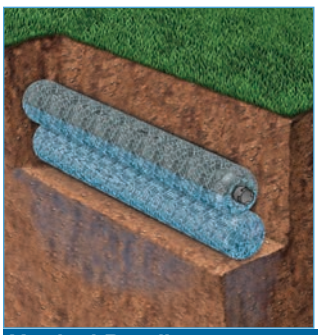
1206H-GEO 1402H-GEO 1303H-GEO 1802H-GEO